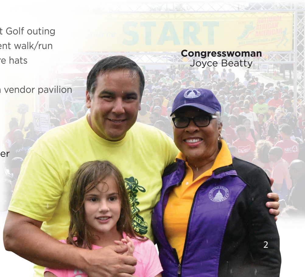
Congresswoman Joyce Beatty